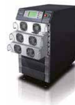
Up to 3 Modules in One Cabinet