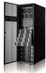
Scalable and Hot-swappable