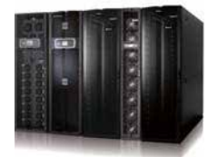
The Modulon DPH is designed in modern IT aesthetics aligned with Delta InfraSuite datacenter solutions.

* When input voltage is 140/242~176/305 Vac, the sustainable loading is from 60% to 100% of the UPS capacity.