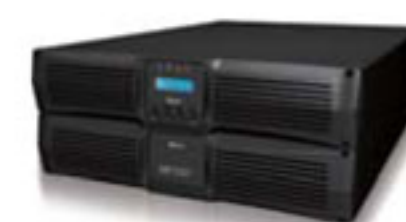
5/6 kVA + Battery Pack

All specifications are subject to change without prior notice.