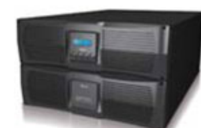
10 kVA + Battery Pack